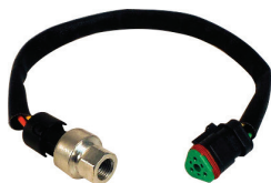
Oil Pressure Sensor