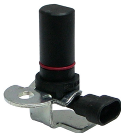
Crankshaft Position Sensor