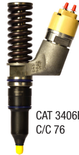
CAT 3406E C/C 76