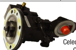
Celect Inj Pump C/C 373

ProDiesel Warranty Nationwide Limited Warranty: 12/18 months / Unlimited Mileage NON-PRORATED Warranty