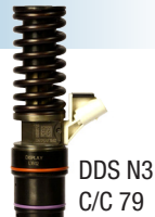
DDS N3 C/C 79