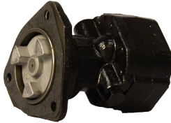
DD SERIES 60 COMP C/C 70