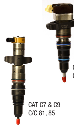
CAT 3126E C/C 89