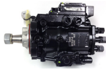
VP44 FUEL PUMP 5.9 C/C 573