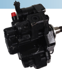
CUM HPCR PUMP C/C 328