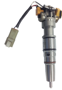
INT G2.9 C/C 97 & 102