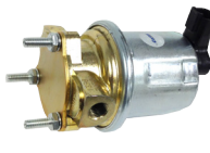
LIFT PUMP VP44/5.9 C/C 50