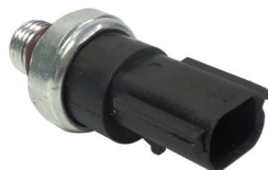
Oil Pressure Sensor