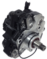
DURAMAX 6.6 PUMP C/C 42