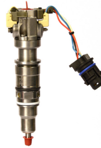
FORD 6.0L POWER STROKE C/C 75