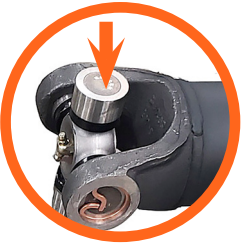
Measurement Point A