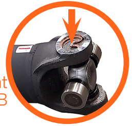
Measurement Point B